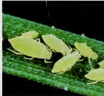
Russian wheat aphid adults and nymphs feeding on a grain leaf.

Like other aphids, the Russian wheat aphid feeds on plants by inserting its mouthparts into vascular tissues to tap the flow of nutrient-rich sap. By itself, such interference with a plant's nutrition can reduce yields. But while it feeds, the Russian wheat aphid also injects a toxin that causes leaves to discolor and roll into strawlike tubes that enclose the pests. Heavily infested grain fields may have large areas of stunted and dying plants.